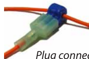
Plug connector into T-Tap

To keep the wires neatly tucked and in line, take the spliced sections and fold them over to one side and tape them in place. This will allow you to place the wiring into loom or have the ability to wrap the LED harness wiring tightly away.