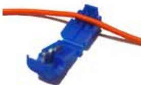
Insert wire onto T-Tap

The last page is a wire diagram of how the LED harness splices into the car's original harness.