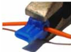
Crimp with pliers