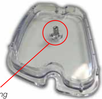
Mounting Stand -off.

2. Screw into the lens the included standoff. It will be snug but not very tight, this will be ok as the LED panel will ultimately be held in place by sitting against the housing.